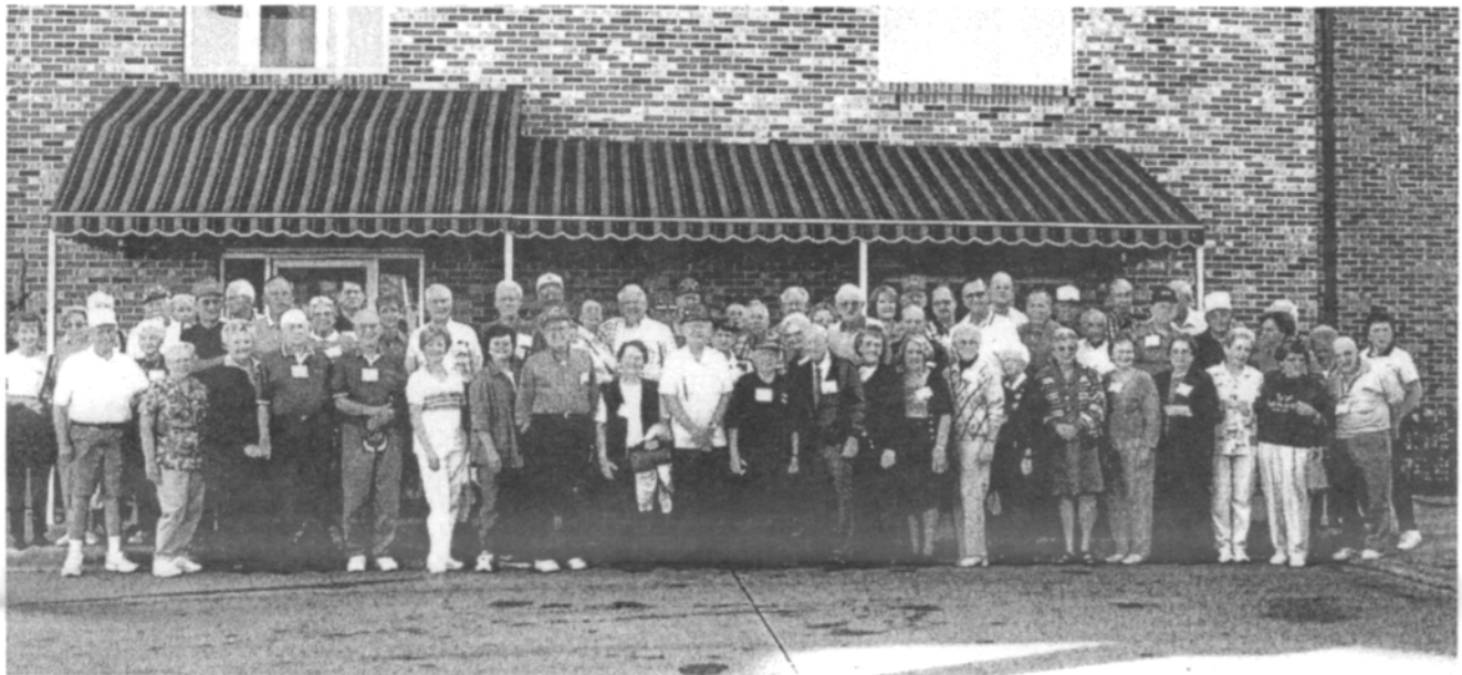
ABOVE GROUP DOCUMENTS CREAM ROSE TO THE TOP AT OMAHA 2001 REUNION

Fifteenth Air Force 55 th Bombardment Wing