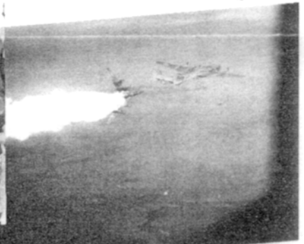
Bad, Bad Day