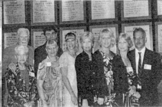
Family Attends Reunion