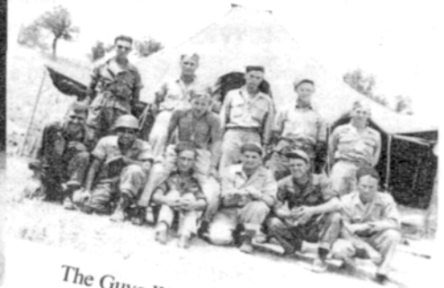
The Guys Who Made Things Work