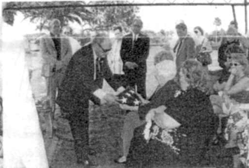
We Honor & Never Forget Our Deceased