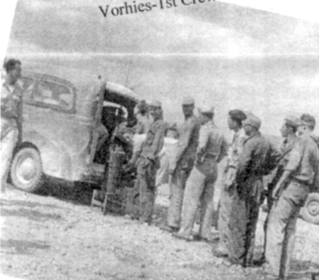
Red Cross-Lemonaid Stand