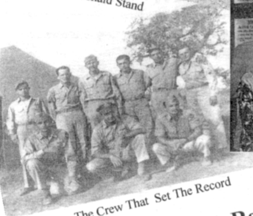
The Crew That Set The Record