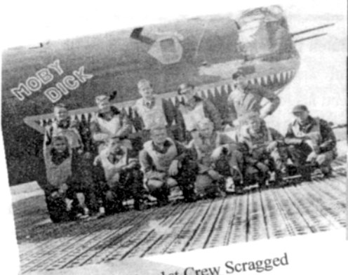
Vorhies-1st Crew Scragged