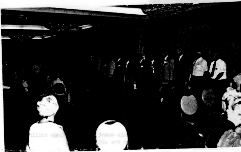
FORMER POWs WERE RECOGNIZED AND RECEIVED A STANDING OVATION