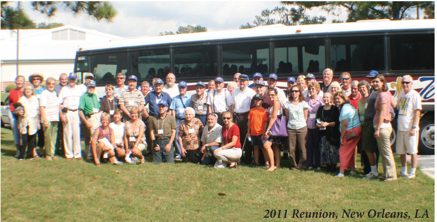
2011 Reunion, New Orleans, LA