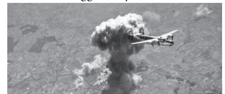
Rising smoke casts its shadow across the Czechoslovakian landscape as one of Fifteenth’s B-24 Liberators leaves the target area of the Pardubice Oil Refinery attacked by heavy bombers on August 24, 1944.

The hope of the Quebec and Pentagon planners was that Fifteenth could operate when eighth was “socked in” by the English weather. Ironically, fifteenth soon faced the same problem in operating from the Mediterranean area. In addition, its planes had to face Alpine clouds with their hazardous icing conditions and their interference with visibility. To complicate matters, there was no convenient English channel for aircraft “ditching” purposes, and aircraft flying with one or two engines knocked out found it hard to go over or around the Alps on the return leg of a mission. Fifteenth’s operational area extended over a large territory stretching westward almost to the Franco-Spanish frontier, northward through Czechoslovakia to Berlin, eastward to the Black Sea, and southward to the Peloponnesian peninsula. Normally, its objectives lay within a 700 mile arc centered at Foggia, Italy.