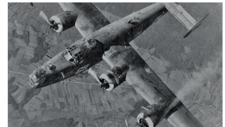
The number four engine of “Burma Bound,” a B-24 belonging to 15th Air Force, was hit by flak as the plane returned from bombing a target at Munich. It limps toward home on three engines.

with P-38s (Lightening) and one P-47 (Thunderbolt) group were assigned. This was soon increased by three more units with P-47s which later converted to P-51s (Mustang). Eventually, a photo reconnaissance group with F-5s joined the command. Intermediate supervision between Fifteenth and its units was exercised by eight wings. From activation to June 1944 the command gained a number of units, eventually reaching strength of 21 Bomb Groups (6 B-17 and 15 B-24) and 7 Fighter Groups (2 P-38, 3 P-51, 1 P-47). Fifteenth thus became second only in size to Eighth Air Force among overseas air commands.