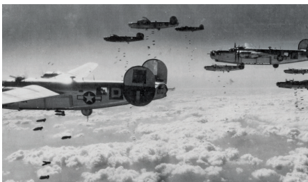
A formation of B-24 “Liberator” bombers of 15th Air Force release their payload on the rail yards at Heiligenstadt, Austria on March 22, 1945.

Fifteenth was not, however, merely created in a two-day span as either an afterthought or in response to a momentary crisis. Rather, its activation came about due to the unfolding events and decisions associated with the overall war effort. On May 9, 1943, the North African campaign has been successfully concluded with and Allied victory over the Axis powers – the first one over Germany and Italy in the Mediterranean theater of operations. The following August the Combined Chiefs of Staff worked on plans at the Quebec Conference for a cross-channel invasion from England to France to be launched in the spring of 1944. General Henry H. “Hap” Arnold, chief of the Army Air Forces, questioned whether Eighth Air Force was able to conduct the required bomber offensive alone. British Air Chief Marshal Portal agreed with him and pointed out that operations from southern Italy would be nearer to the vital German fighter aircraft factories in the area around Vienna, Austria.