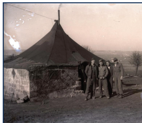
Cecil B. Cantrell is first from the right.