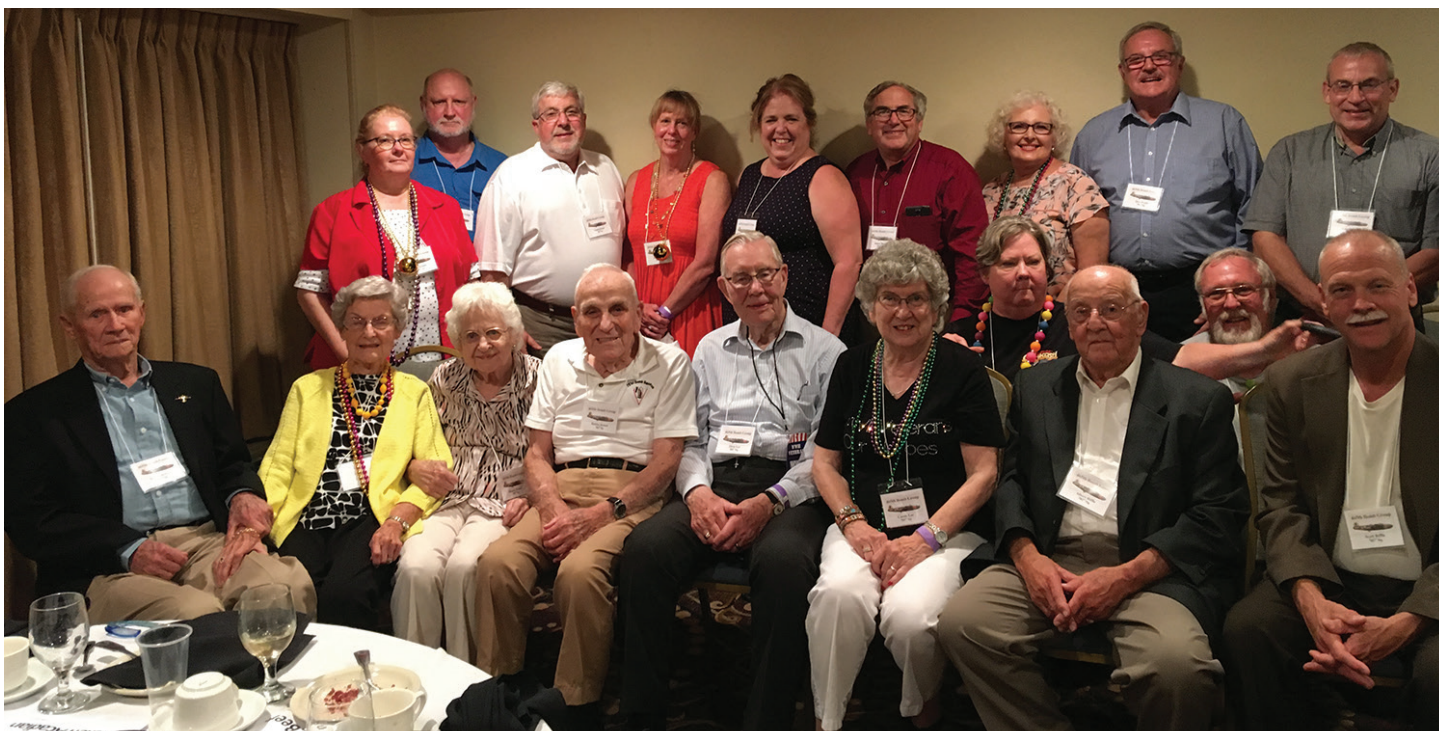
Photo of 781 st and 782 nd combined attendees